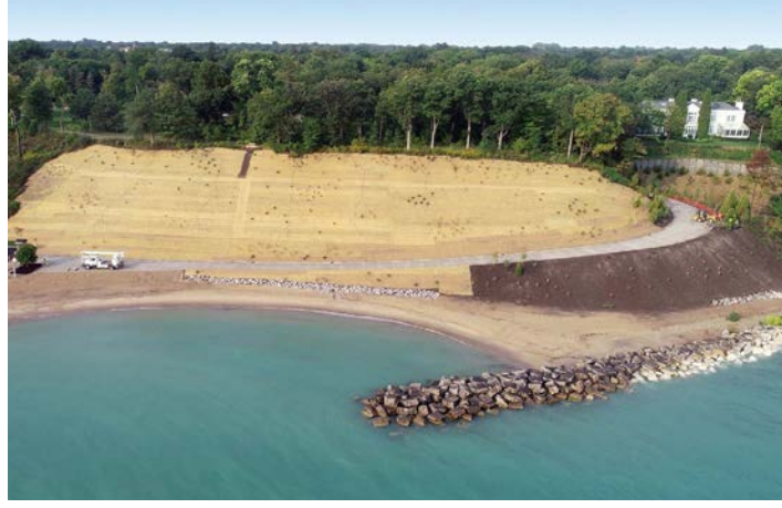
North Beach Bluff & Road Restoration Project