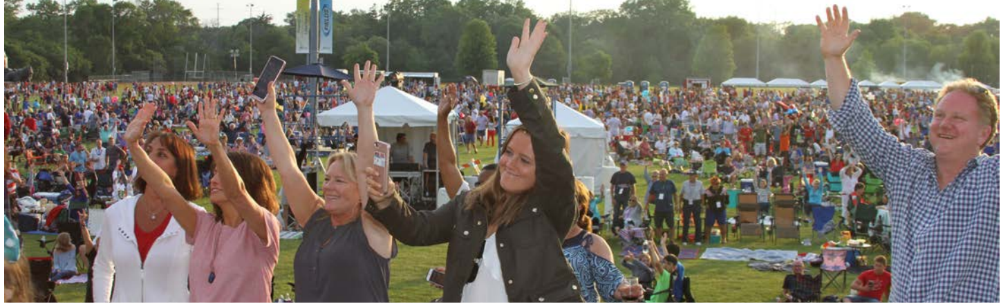
Lake Forest Festival & Fireworks