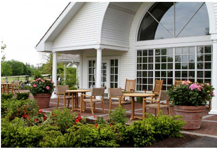
Deerpath Golf Course Renovation Project