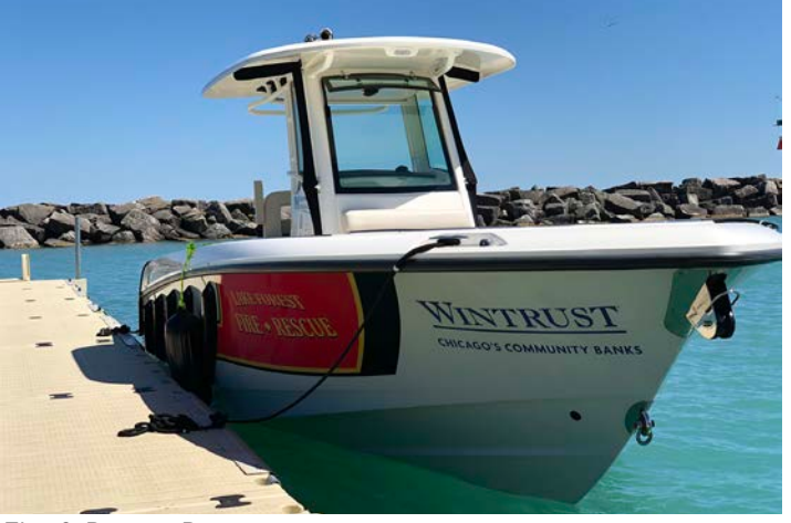
Fire & Rescue Boat